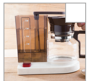
Remove any filters and clean coffee machine/electric kettle. Empty and rinse thermos jugs