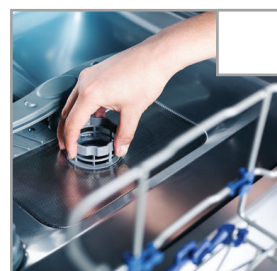
Empty the filter in the dishwasher