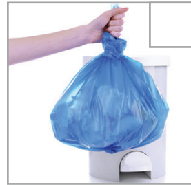
Toilet bin is emptied