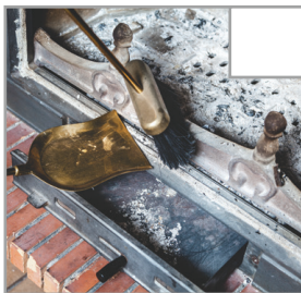
Fireplace is emptied and cleaned. Never place ash in trash bin due to fire hazard