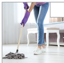
All washable floors are mopped