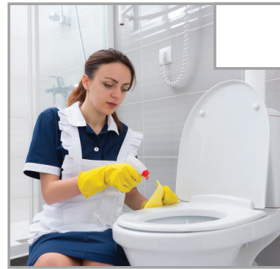
Clean toilet inside and out