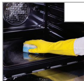
Oven door is cleaned of grease with a scouring sponge