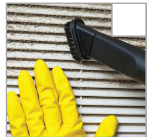
Cobwebs are removed. Make sure to get into all corners