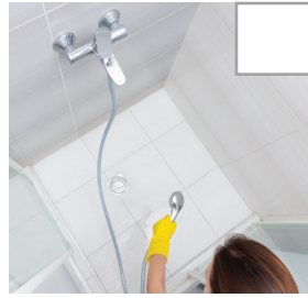
Clean the shower niche and remove hair and other dirt from the floor corners and near the drain