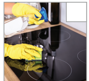
Stove top is cleaned