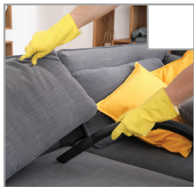
Chairs and sofas are vacuumed thoroughly, including under cushions