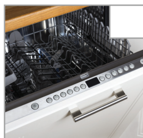
Empty the dishwasher