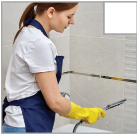
Please leave the last bath water in the spa or fill the spa with clean water above the jets, so our staff can disinfect and clean the spa