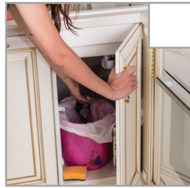
Remove trash bag and wipe inside of cabinet