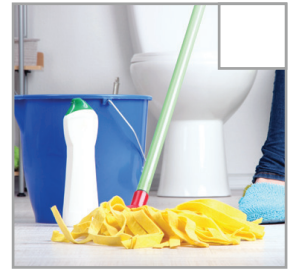
Floor is mopped