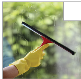
Windows are cleaned for grease stains