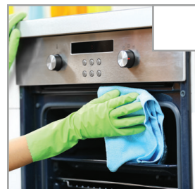
Oven and any microwave are cleaned inside and out