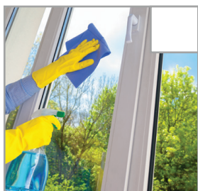
Windows and patio doors are cleaned for grease stains