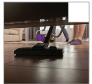
Vacuum and mop the floor. Don't forget under the bed