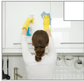
Cabinet doors and drawers are wiped down