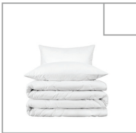
Vacuum the bed. Arrange pillows and duvets neatly on each bed