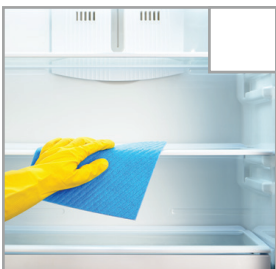
Refrigerator is emptied and cleaned