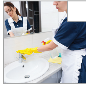
Sink and faucet are cleaned