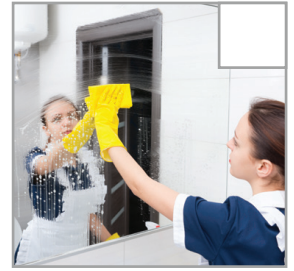
Mirrors are cleaned with window cleaner