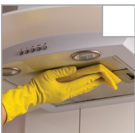
Range hood is cleaned with a damp cloth; if extendable, pull it out fully