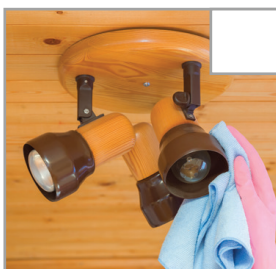
Wipe lamps with a dry cloth