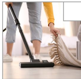
Vacuum the floor including rugs (also under loose rugs)