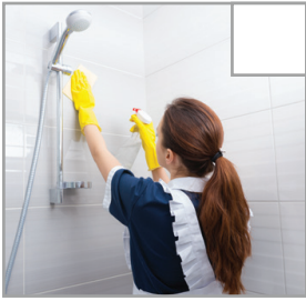
Faucet is cleaned